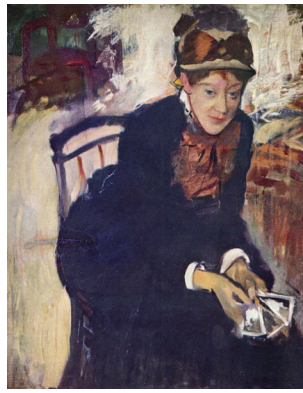
Portrait by Edgar Degas, c. 1880