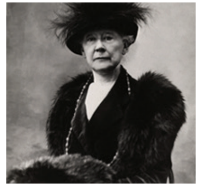
Photo, later in life