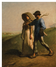
Going to Work

Victoria and Albert Museum, London, England, 1854, 16" x 13"