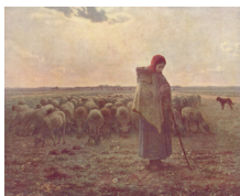
Shepherdess with Her Flock

Palais des Beaux-Arts de Lille, France, c. 1850, size unknown