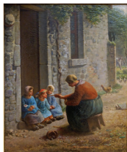
Feeding the Young or La Becquée

Palais des Beaux-Arts de Lille, France, c. 1850, size unknown