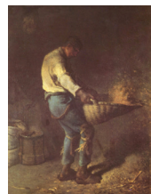
The Winnower or Le Vanneur

Cincinnati Art Museum, Cincinnati, OH, 1851-53, 22" x 18"