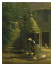
The Well at Gruchy

Musée d'Orsay, Paris, France, c. 1863, 32" x 40"