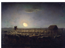
The Sheepfold, Moonlight

Walters Museum, Baltimore, MD, 1856-60, 18" x 25"