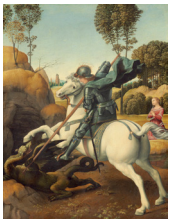
Saint George and the Dragon

The National Gallery, London, England, 1503-4, 6.7" x 6.7"