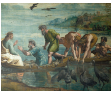
The Miraculous Draught of Fishes

Royal Collection Trust, c. 1515-16, 10' 6" x 13' 1"