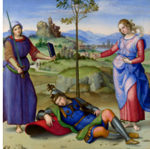
The Vision of a Knight

The National Gallery, London, England, 1503-4, 6.7" x 6.7"