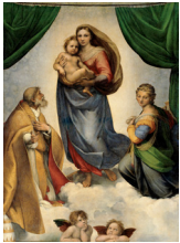
Madonna di San Sisto

National Gallery, Washington, D.C., c. 1505, 11" x 8.5"