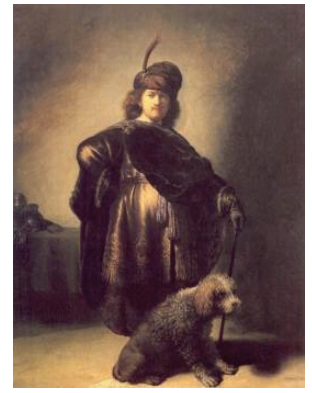
Self-portrait in Oriental attire, 1631