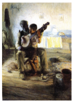
The Banjo Lesson

Private Collection, 1894, 35.5” x 44.25”