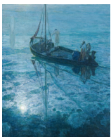
The Disciples See Christ Walking on Water

Des Moines Art Center, Des Moines, IA, c. 1907, 51.5” x 42”