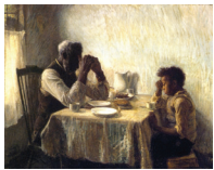
The Thankful Poor

Private Collection, 1894, 35.5” x 44.25”