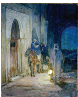
Flight into Egypt

Philadelphia Museum of Art, Philadelphia, PA, 1898, 57” x 71.5”