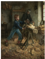
The Young Sabot Maker

Hampton University Museum, Hampton, VA, 1893, 49” x 35.5”