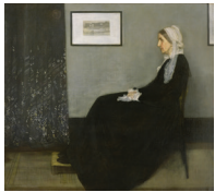
Arrangement in Grey and Black No. 1

Musée d'Orsay, Paris, France, 1871, 56.75" x 64"