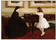
At the Piano

The Taft Museum of Art, Cincinnati, OH, 1858-59, 26.25" x 36"