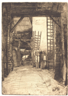
The Lime Burner

Detroit Institute of the Arts, Detroit, MI, 1875, 23.75" x 18.25"