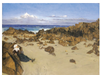
The Coast of Brittany

Wadsworth Atheneum Museum of Art, Hartford, CT, 1861, 34.25" x 45.5"