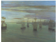
Crepuscle in Flesh Colour and Green: Valparaiso

The Taft Museum of Art, Cincinnati, OH, 1858-59, 26.25" x 36"